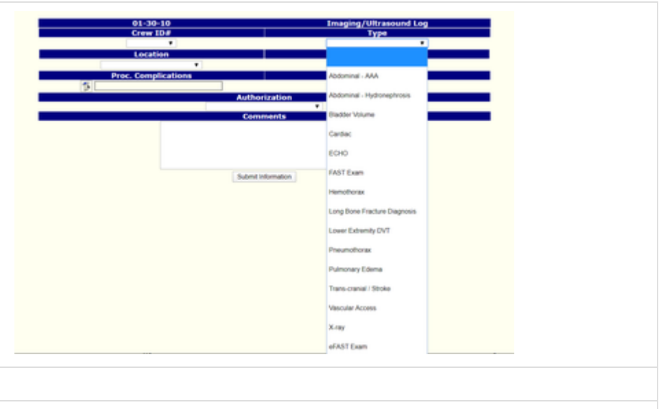
Fig 2. - List of possible Imaging/Ultrasound types within the Imaging/Ultrasound Procedure.

New Feature - Custom Form Web Signatures